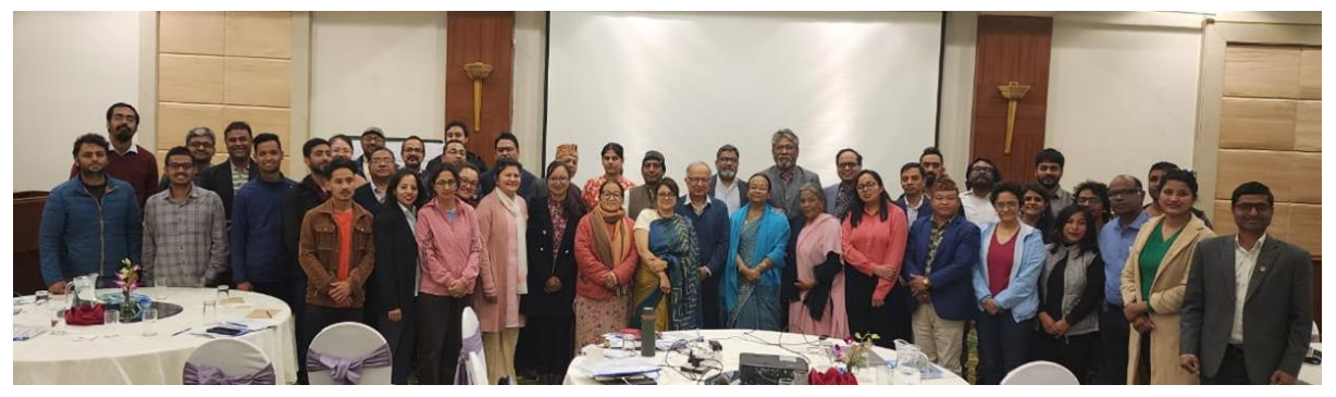
Group picture of the participants at the end of Day 1

The first day of the programme commenced with the launch of the IUCN's baseline report on the scenarios for sustainable energy transition in the Ganges River Basin. It was followed by a breakout session wherein the participants were divided into mixed country groups to discuss the narrative drivers for regional cooperation among Nepal, India, and Bangladesh on the matter. The end of the day witnessed development of a plan for communication outputs (articles, reports, audio-visual resources, etc.) and a study tour on Day 2.