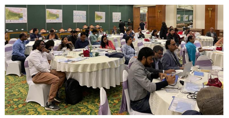
Participants during a panel discussion on 'Sustainable Energy Transition in the Ganges River Basin'

Energy is one of the main drivers of social, economic, and ecological change in the Ganges River Basin, with a number of hydropower and coal projects operational and planned in the region. In India and Nepal, energy policies promote hydropower development as one of the main strategies to achieve energy security. In low-lying Bangladesh, energy security strategies rely on imported power from neighbouring Nepal and India, as well as the development of advanced coal-fired power plants.