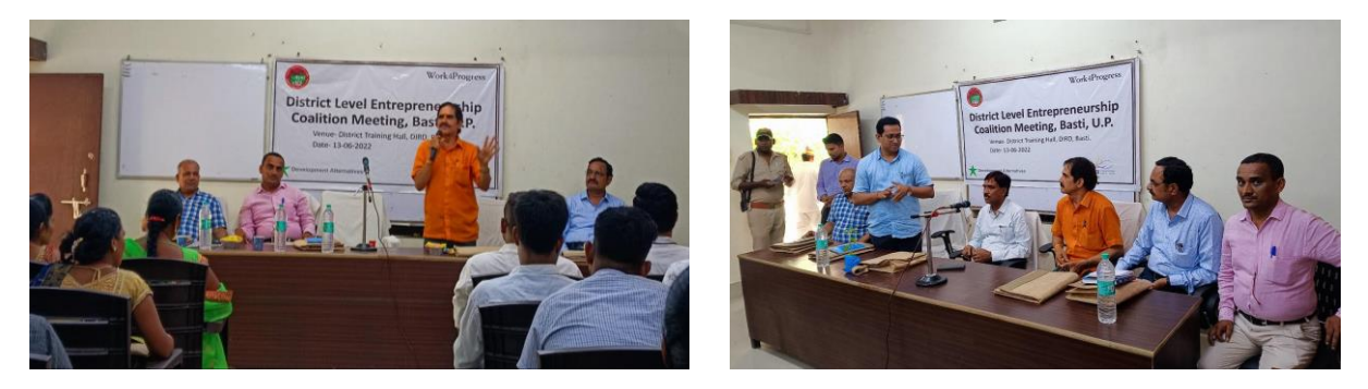
Officials interacting with entrepreneurs

To accelerate rural enterprise development at the district level, an inception meeting for the Regional Entrepreneurship Coalition was conducted in Basti district, Uttar Pradesh on 13 June, 2022. This meeting was hosted by the District Training Officer and anchored by Transform Rural India Foundation (TRIF), under the Work4Progress programme.