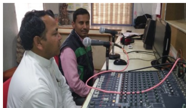
Transmission of COVID-19 related information to 2L individuals across 150 villages