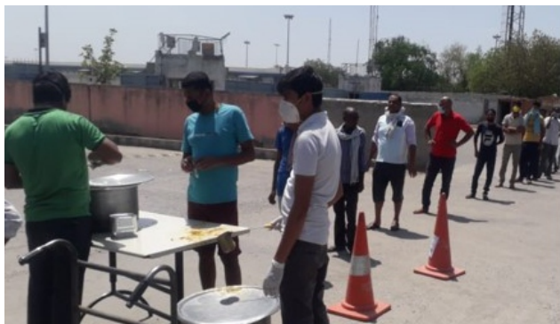
Cooked Food Distribution