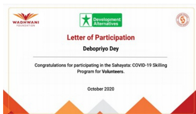
People oriented on COVID-19 with Wadhvani Foundation