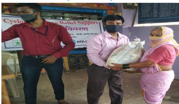
Cyclone Nisarga Relief- 1,200 families