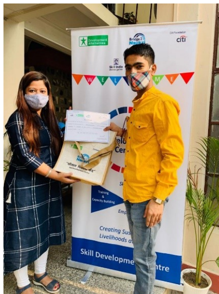
Picture from the Graduation Ceremony held for trainees at Ghitorni Centre

During the WhatsApp training, a project was assigned to a group of 34 students to prepare their Email ID's with the help of a video which