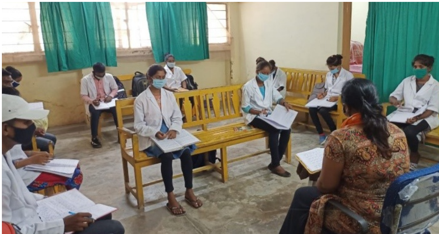
Glimpse from the classroom at Bilaspur, Chhattisgarh

Under FICCL – Women Empowerment project, need based vocational training was being imparted to underprivileged women in rural and peri-urban areas of Rajasthan and Chhattisgarh.