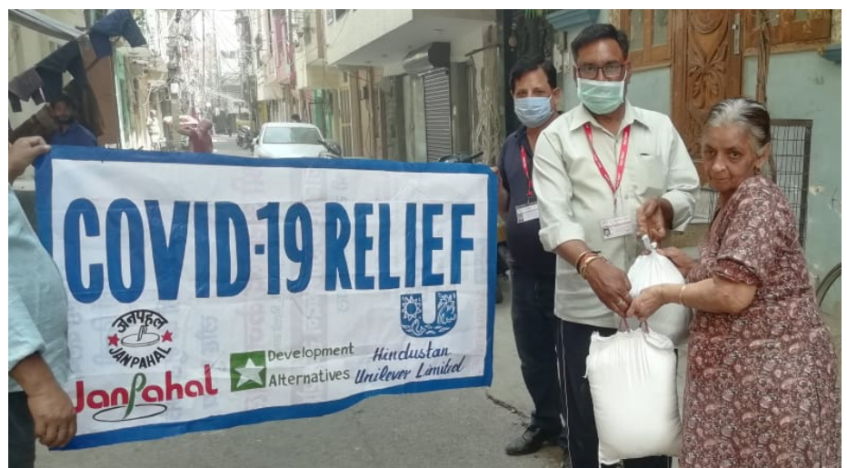
Food distribution through social distancing

Overall it has been mentally satisfying that WE as people stood up and helped our brethren in need. Thank you all who helped humanity in the time of need.