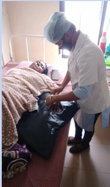
A student during her on job Training

When she heard that the course has been offered free of cost, she immediately enrolled for it not wanting to lose the opportunity.