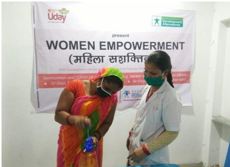
A glimpse of classroom training on Sanitization and COVID-19 awareness Training

While the field team was on ground for mobilization, the course outline, the content and budgets have been prepared for implementation simultaneously.