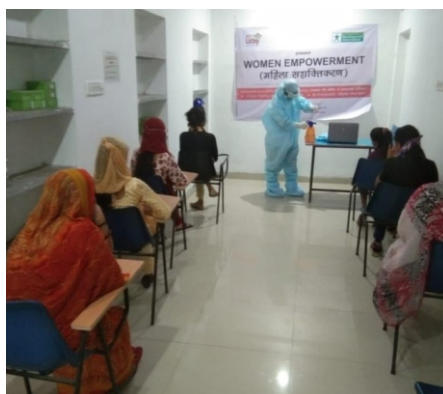
A trainee under Women Empowerment Project learning using a manual disinfectant sprayer

Under the project, on the completion of training, the trainees will be provided with the hand holding for a month. The hand holding includes counselling and the material: Spray Machine, disinfectant and a reusable PPE kit.