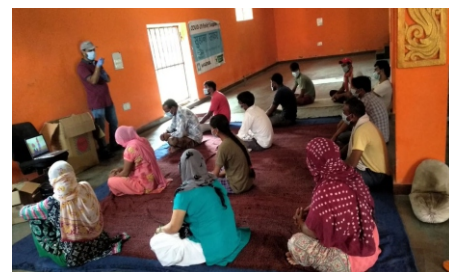
COVID-19 awareness session

In order to facilitate these community interventions, necessary procurements were made like Infra-red thermometer, sanitizer, Nitrile gloves and masks. A team was deputed and given a brief orientation cum guideline session over conference call by Master Trainers and project coordinators. An interactive presentation was prepared on the concerned subject of "COVID-19 - safety and precautions" to be delivered in community awareness programmes.