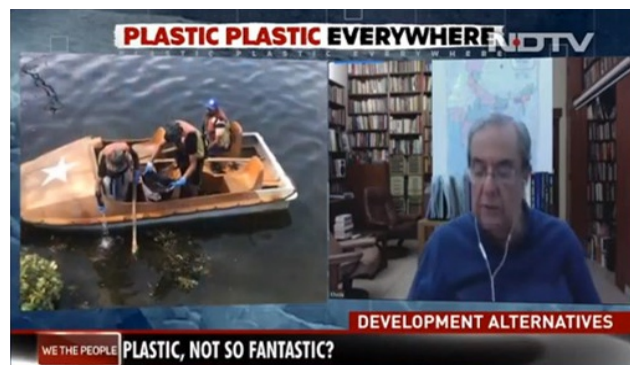
NDTV coverage of UNEP project