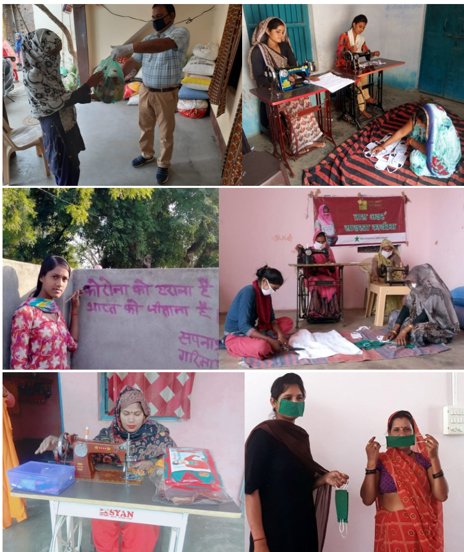
Women stitching mask and spreading awareness on COVID-19

With the help of the Gram Panchayats our neo-literates from two villages in Babina