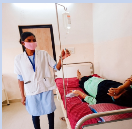
A student during on her practical session