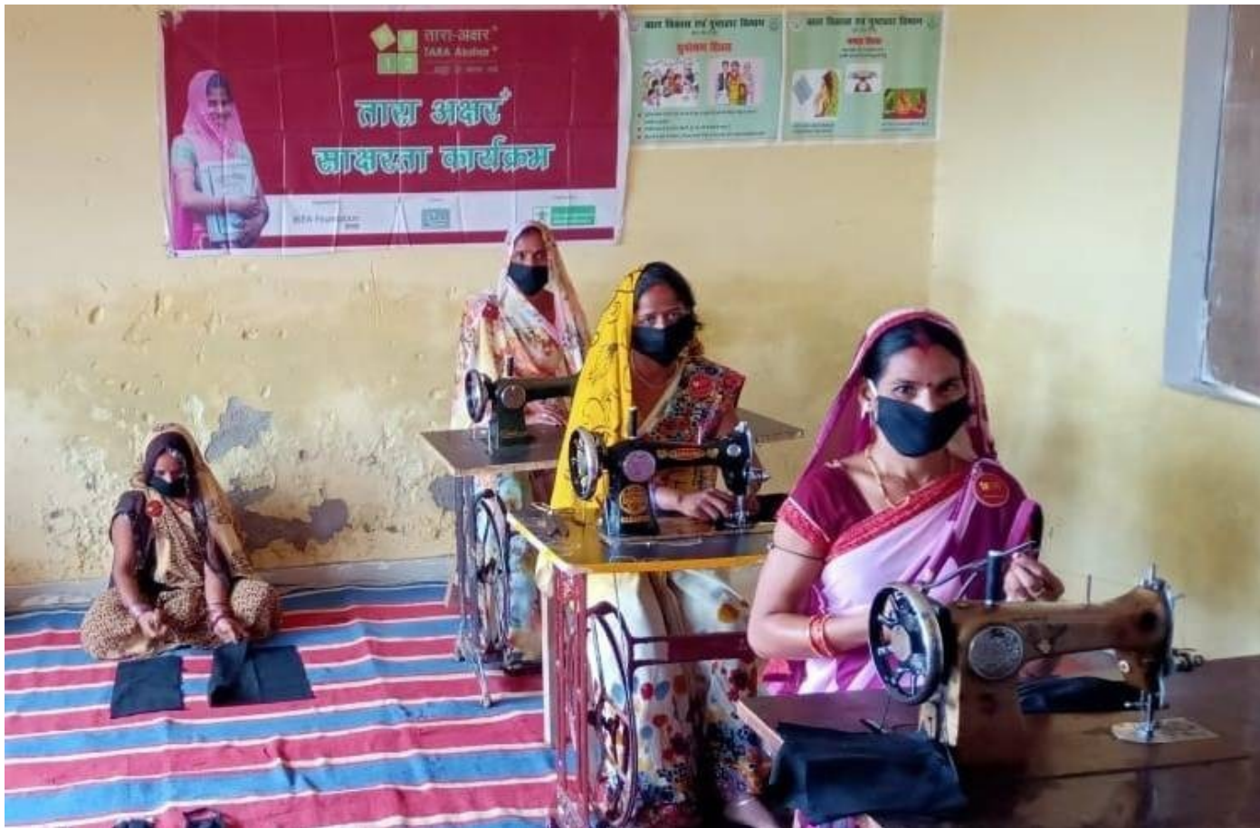
Sewing their dreams together

"This change has just one language i.e. language of 'women empowerment'"