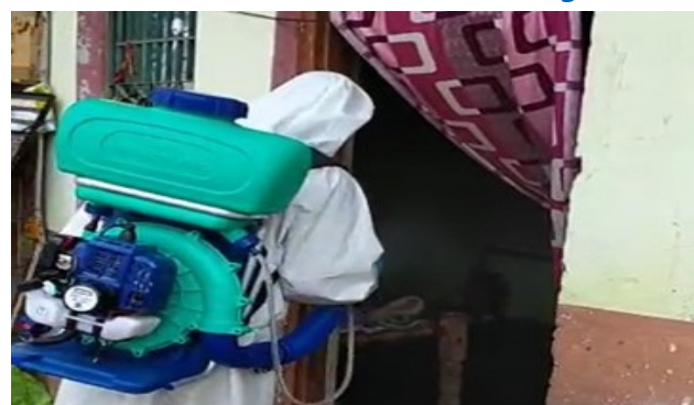
Village Sanitisation at Dadri – 1 km area