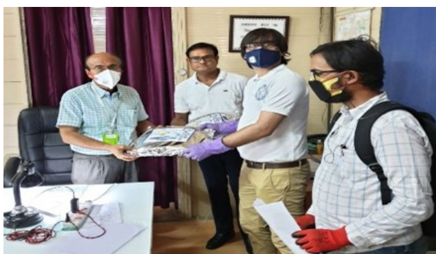
PPE Kit Distribution in Govt. Hospitals (Delhi –NCR)