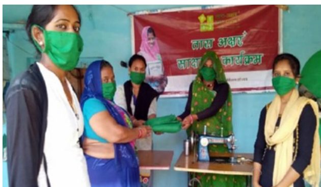
TA+ Neo-literates stitched masks for distribution