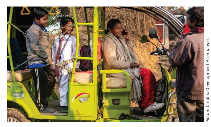
E-rickshaw driven and managed by a woman in Uttar Pradesh, India

A few key elements of the Gandhi's philosophy –