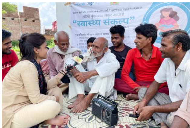
Community feedback session with Radio Bundelkhand

The programme has improved, connected and