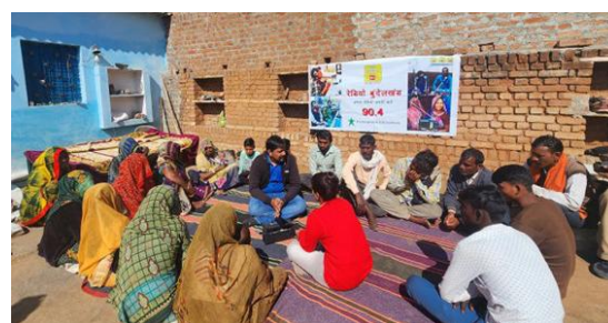
Narrowcasting session in Bundelkhand: A united voice against climate challenges

These policy shifts have profoundly impacted the community radio landscape in India. The once-restricted corridors of educational institutions have expanded into a vibrant symphony of voices, encompassing agricultural insights, community development initiatives and the rich tapestry of civil society endeavours.