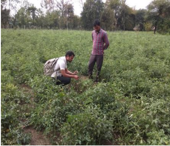
Field visit: informing about diseases and pests