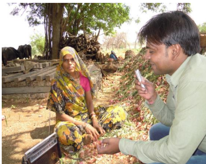
Interviewing about vegetable farming

These success stories underscore how Kisan Vani Sironj, with its accessible and targeted information, has empowered farmers to embrace sustainable and informed agricultural techniques. Bridging the knowledge gap, this community radio station continues to be a catalyst for change, fostering a culture of agricultural innovation in the region.