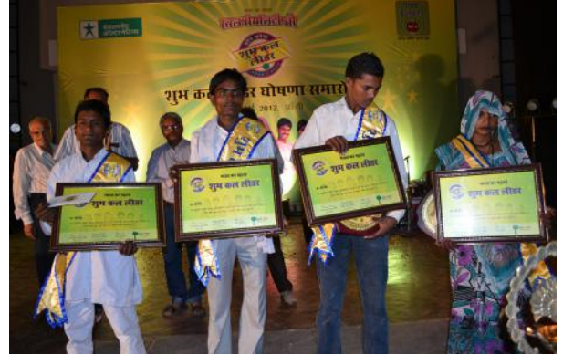
Winners of 'Kaun Banega Shubh Kal Leader'

The programme's success hinges on active engagement through various activities such