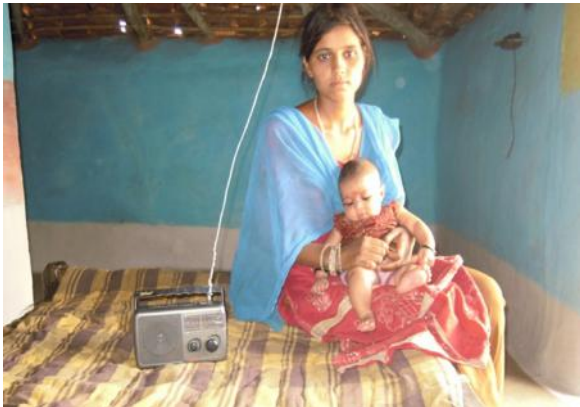
Kisan Vani Sironj listeners tuning in to the radio